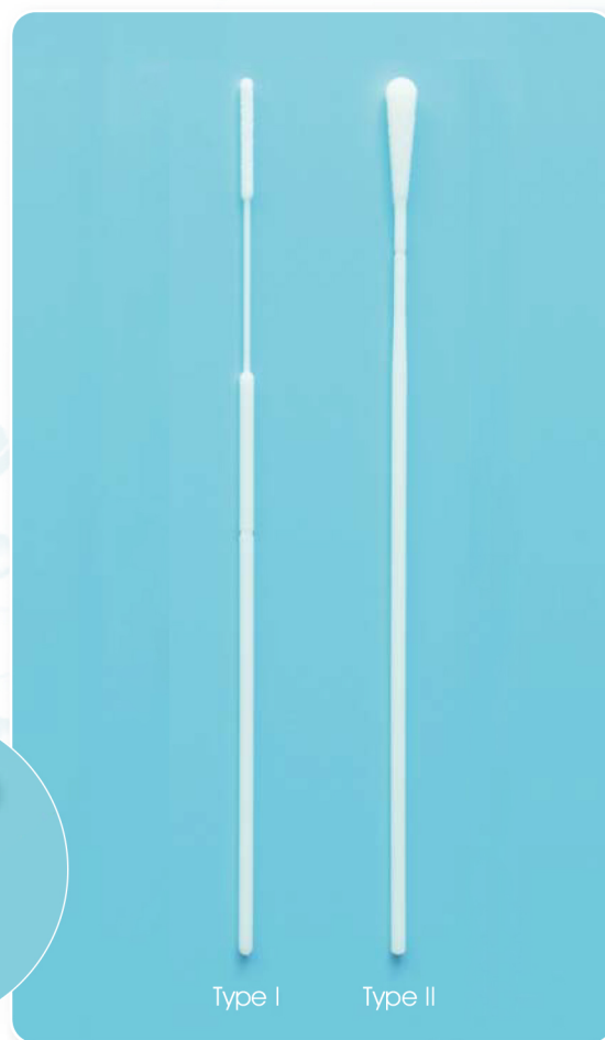
Type II for throat , Type I for nasal