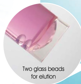
Two glass beads for elution

★ Upgraded preservation medium based on international standards has good bacteriostatic performance and efficient storage, which greatly improves the positive rate of virus isolation.