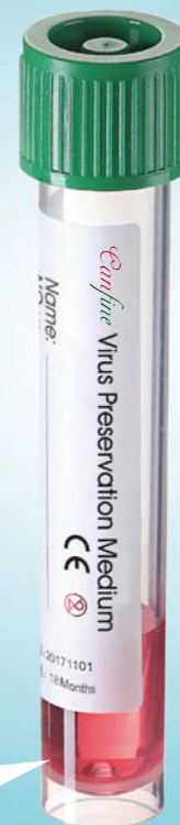
Medium Type 1 in the Tube