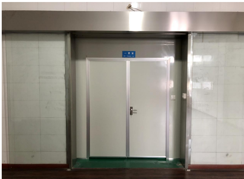
300,000 class clean room