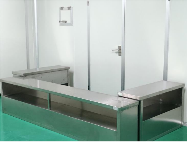
300,000 class clean room